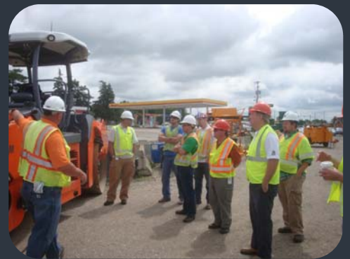
IC equipment demo

Each workshop includes presentations and hands-on exercise materials for a one-day training. PCs with internet connection and pre-installed with Veda workshop software are required for all participants. Host agency should provide a facility (40~60 people) in classroom style with a LCD projector, a screen, electricity outlets and/extension cords. Optional equipment demo requires a parking facility.